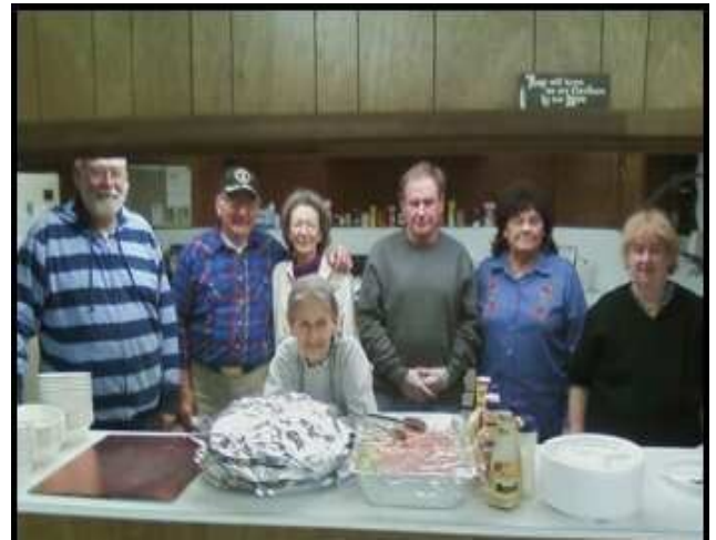
Soup Kitchen Ministry continues with our faithful workers serving up tasty meals every fifth Thursday of the month. Last week, on May 31, the group served 23 people.

NORTH AMERICAN DIVISION OF SEVENTH-DAY ADVENTISTS® MINISTRIES Women's Ministry for Every Woman