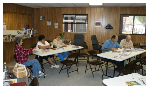
Studying Spiritual Gifts and how to use them in our church