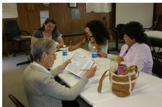
Nature Scripture Search for scavenger hunt clues!